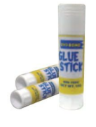
EB-611 (GLUE STICK)