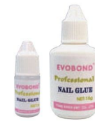
NG-I series (3g, 15g)