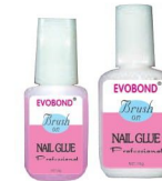
NG-BO series (5g, 15g)